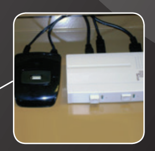
USB Switch & Hub Connect, switch, & charge mobile devices with 4port USB hub/