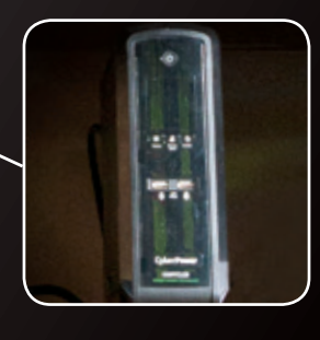
Back-Up Power Supply Up to 30 minutes of emergency power

In box power supply provides 4 GFCI outlets for safer in-box power