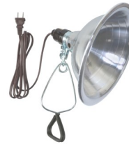
$6.95 COL0151: Clamp on Light Uses standard light bulbs (not included)