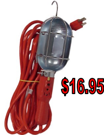
$16.95 COL0691: Trouble Light 25' Cord, Metal guard w/ outlet