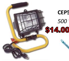
$14.00 CEP5125-I: "Stubby" 500 Watt 1 ft Height