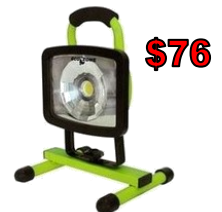
$76 COLL-1681: 23W LED, 1474 Lumens Shadow Free