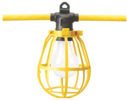
Bulbs not included