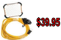
$39.95 CEP97120: Temp Job Site Light, LED 6.6w, 20 ft cord length, 500 lumens.