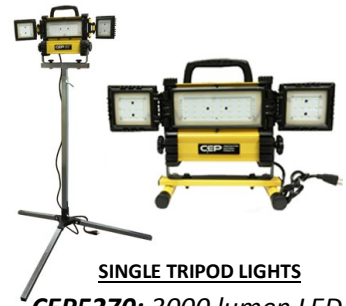
$139 CEP5270: 3000 lumen LED Panel Light w/ 7' Stand $119 CEP5220: LED Panel light w/ out stand