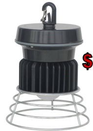
$119 VO08-00402: 78W LED 7600 Lumen, 18/3 wire gauge, High Power COB Bulb