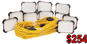
$254 CEP97132: Temp Job Site String Light, LED 66 W, 100ft, 10 lights included, 500 lumens per