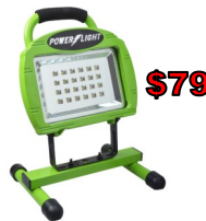
$79 COLL-1320: Rechargeable 24 LED 779 Lumens