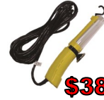
$38 CEP1330FT: Trouble Lights Fluorescent Trouble Light W/ Hook 25ft. 16/3 ga. SJTW cord, 13 watts