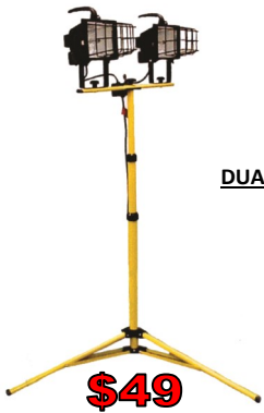
$49 CEP5610-I: 1000W (500w ea) Economy Import Light