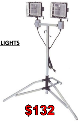
$132 CEP5710: 500 Watt Quartz Heavy Duty.