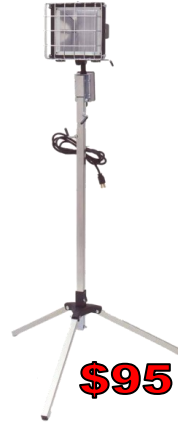
$95 CEP5750: 500 Watt Heavy Duty Quartz Halogen